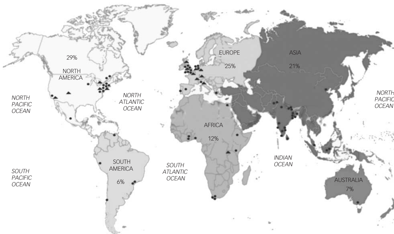
Fig. 2 Location of institutional members (n=77) and regional distribution of individual members (%) (n = 1304). Global organisations are shown as triangles and are located at either the corresponding address of the organisation or its current president. Circles represent institutional partners.

The Movement does not seek to duplicate or compete with the actions of its members; it seeks to build a coalition whose diverse members share a common goal and who can use the Movement to support their own activities and strengthen the Movement simultaneously. In all countries, people affected by mental disorders experience discrimination at multiple levels in society, 6 including within the healthcare system. Once affected by mental disorder, overcoming the layers of social barriers and discrimination is often a far greater challenge than overcoming the illness at the personal level. 6 In spite of international instruments aimed at protecting the rights of people with mental disorders, this community remains among the most vulnerable and neglected groups in all societies. 7 Against this backdrop, the struggle for social justice requires multiple actions, including an increase in availability of and access to a range of mental health services.